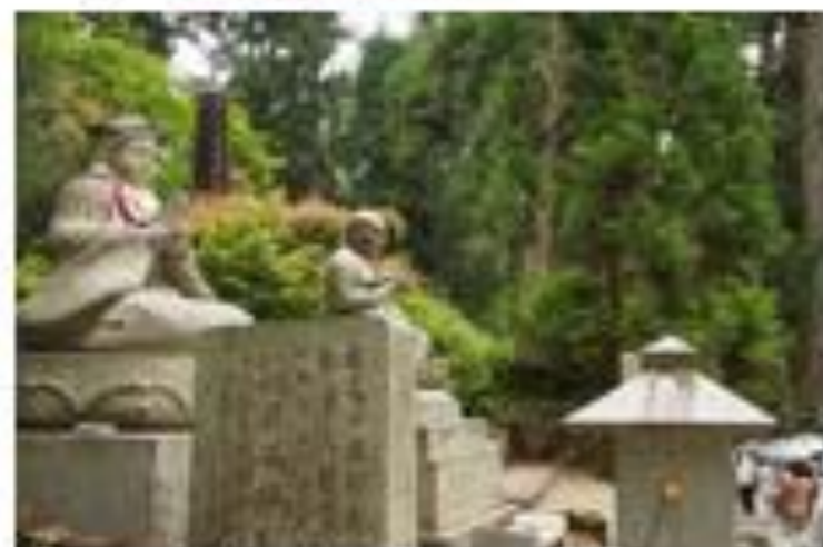
Koyasan Oku no in (inner temple)