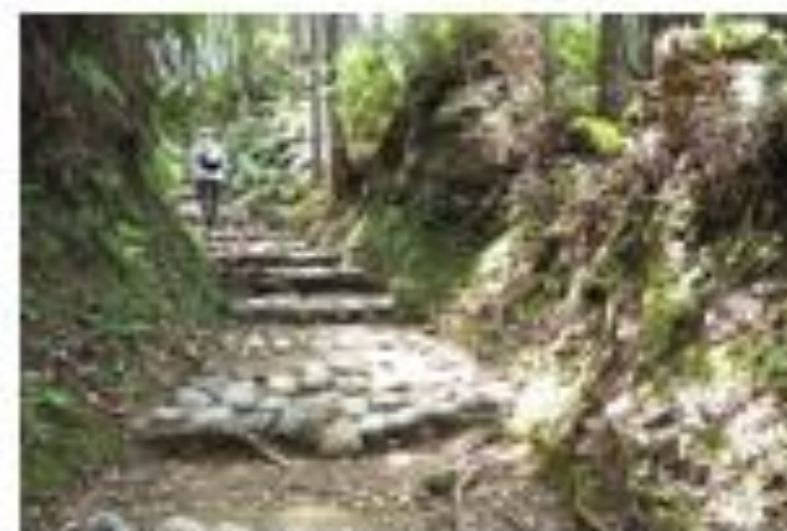
Kumano Kodo Walk (Hosshinmon Oji)