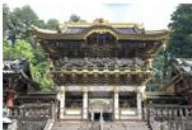
Nikko Toshogu Shrine