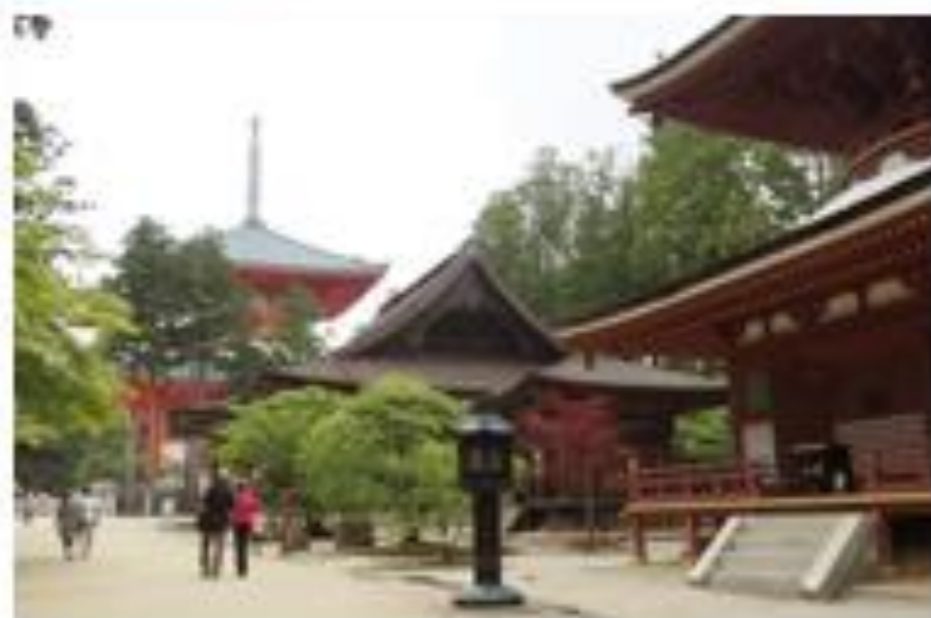
Koyasan Danjō Garan

Niutsubime Jinja Shrine , Koyasan (Mt. Koya) , Kongobuji Temple , Koyasan Oku no in (inner temple)