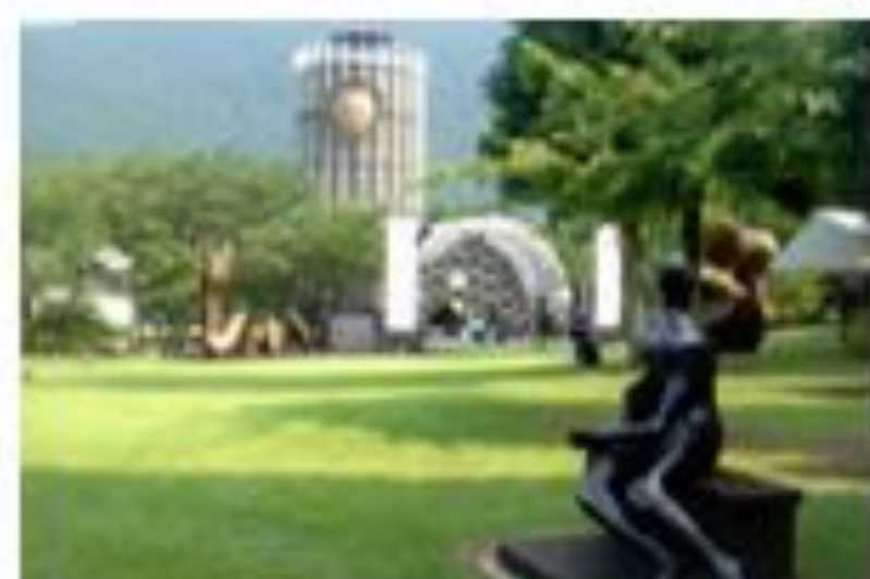
Hakone Open Air Museum