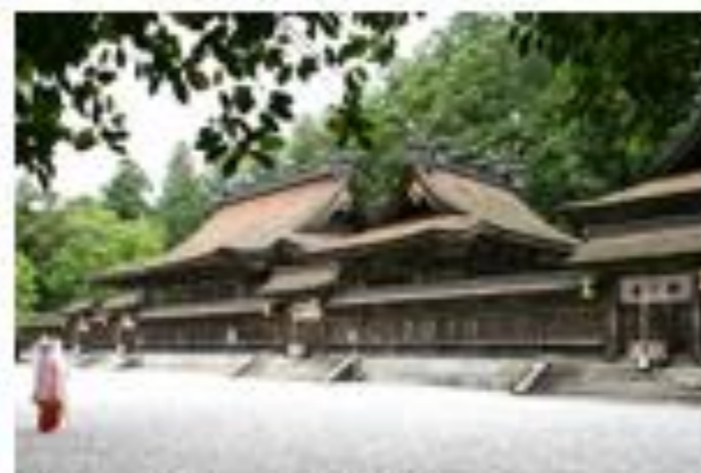
Kumano Hongu Taisha Shrine