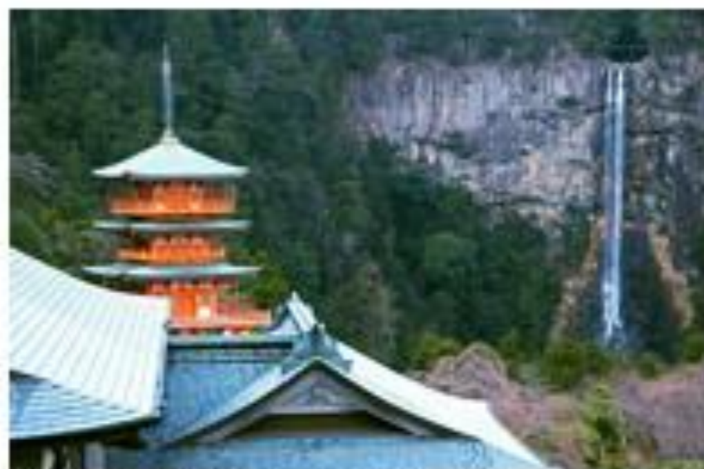
Three-Storey Pagoda and the Nachi Falls