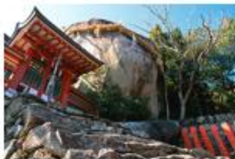
Kamikura Shrine (Goobiki Rock)

*Food, beverages and accommodation costs are not included.