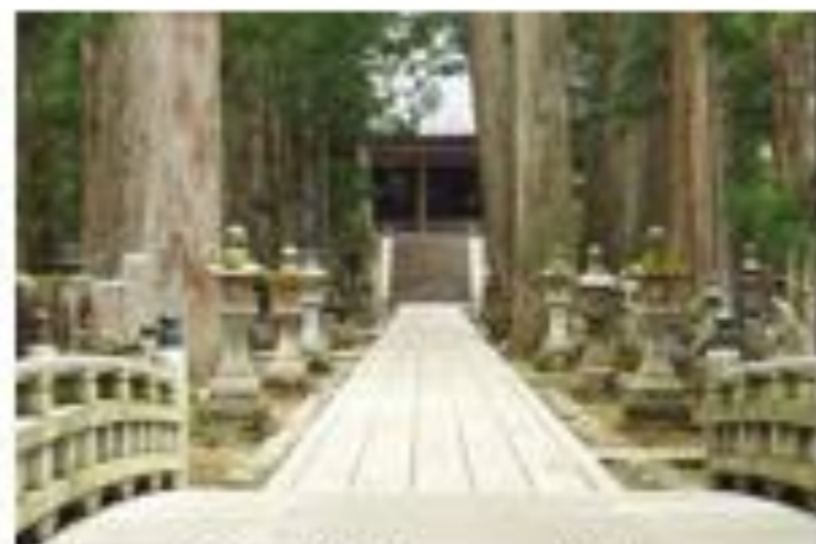
Koyasan Oku no in (inner temple)