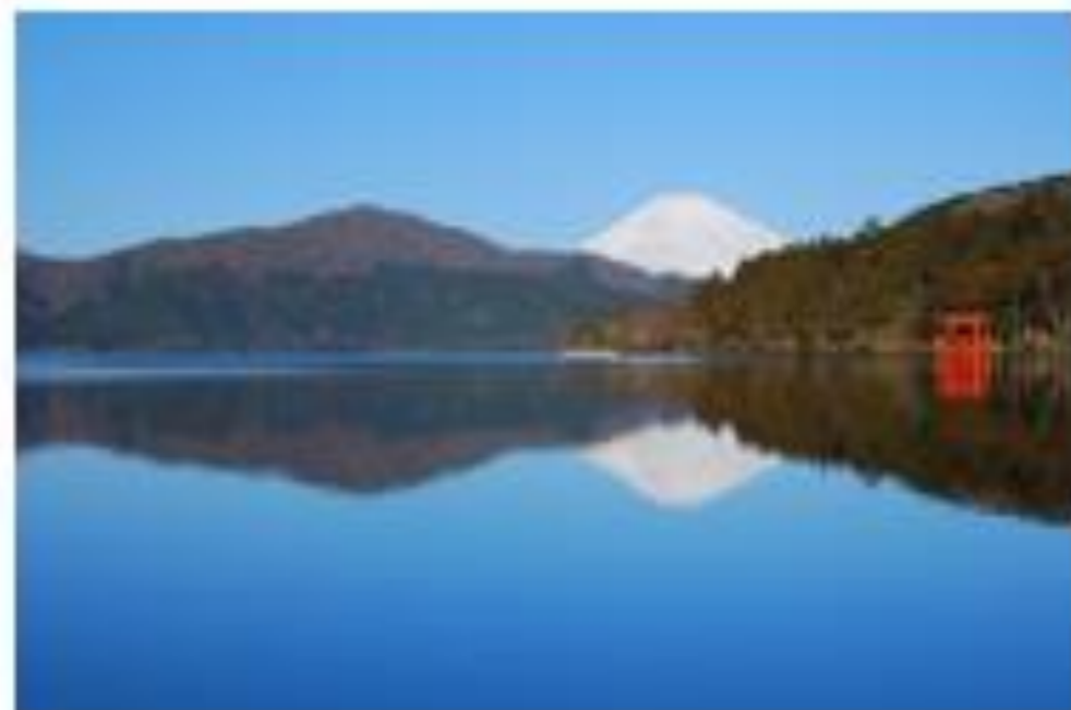
Lake Ashi (Mt. Fuji view)

Lake Ashi , Hakone checkpoint, Narukawa Art Museum , Hakone Open Air Museum, Owakudani Valley