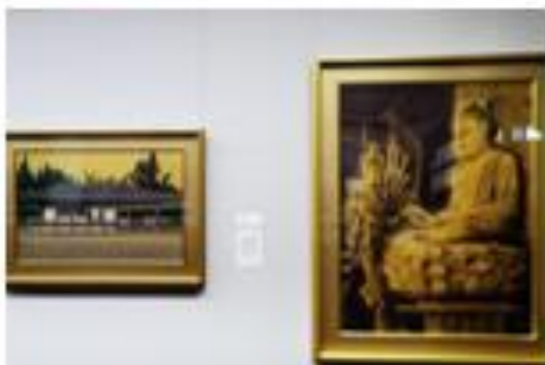
Narukawa Art Museum