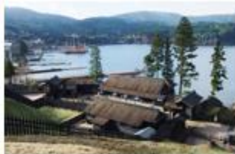
Lake Ashi (Hakone checkpoint)